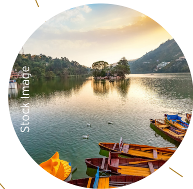
Bhimtal lakes 45 Minutes