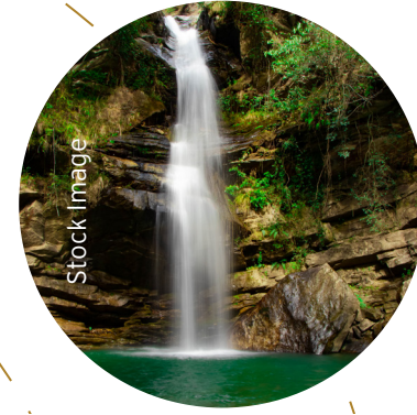
Bhalu Gaad Waterfalls 20 Minutes