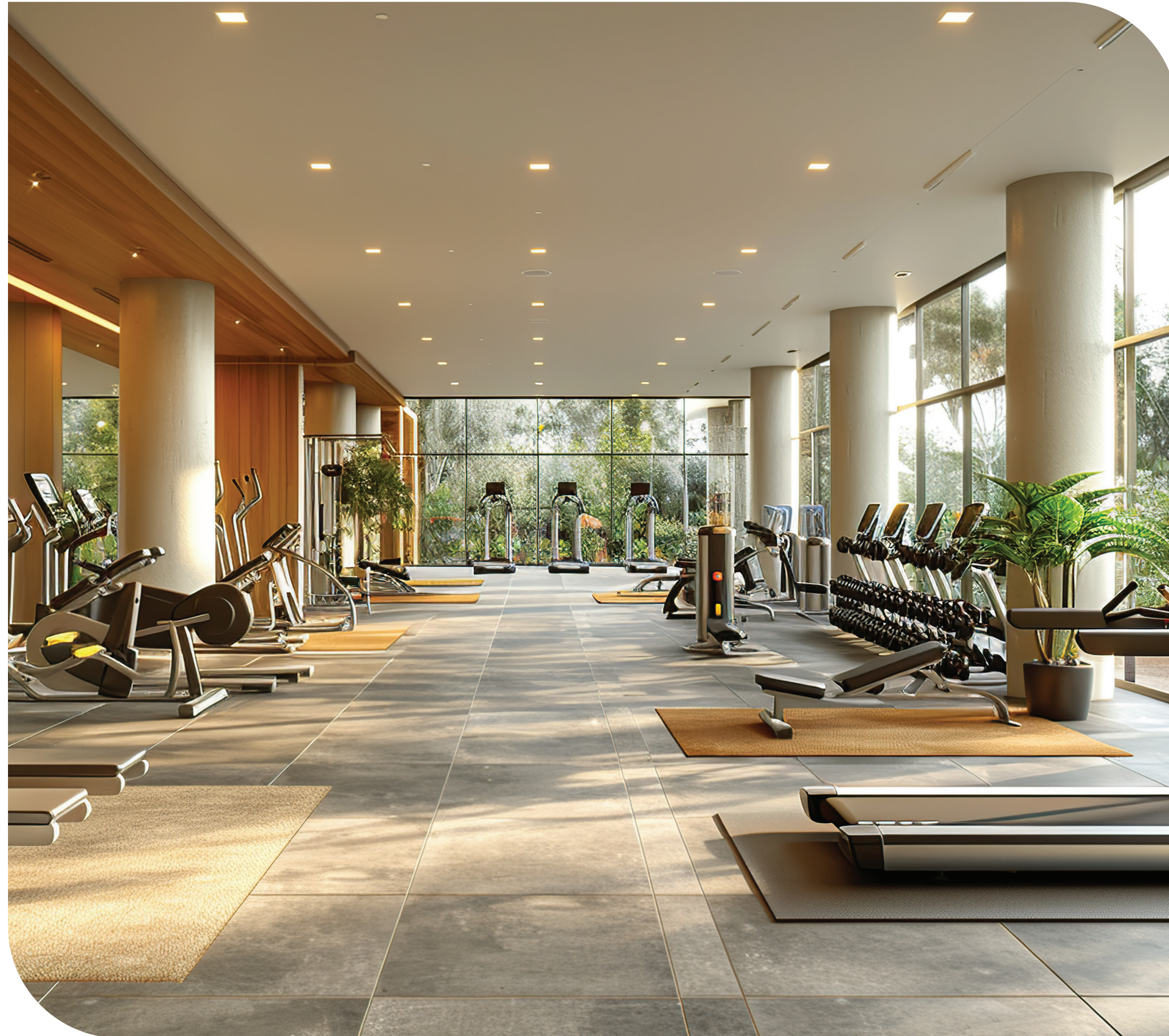
Wellness spaces including gym