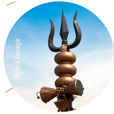
Mukteshwar Temple 60 Minutes