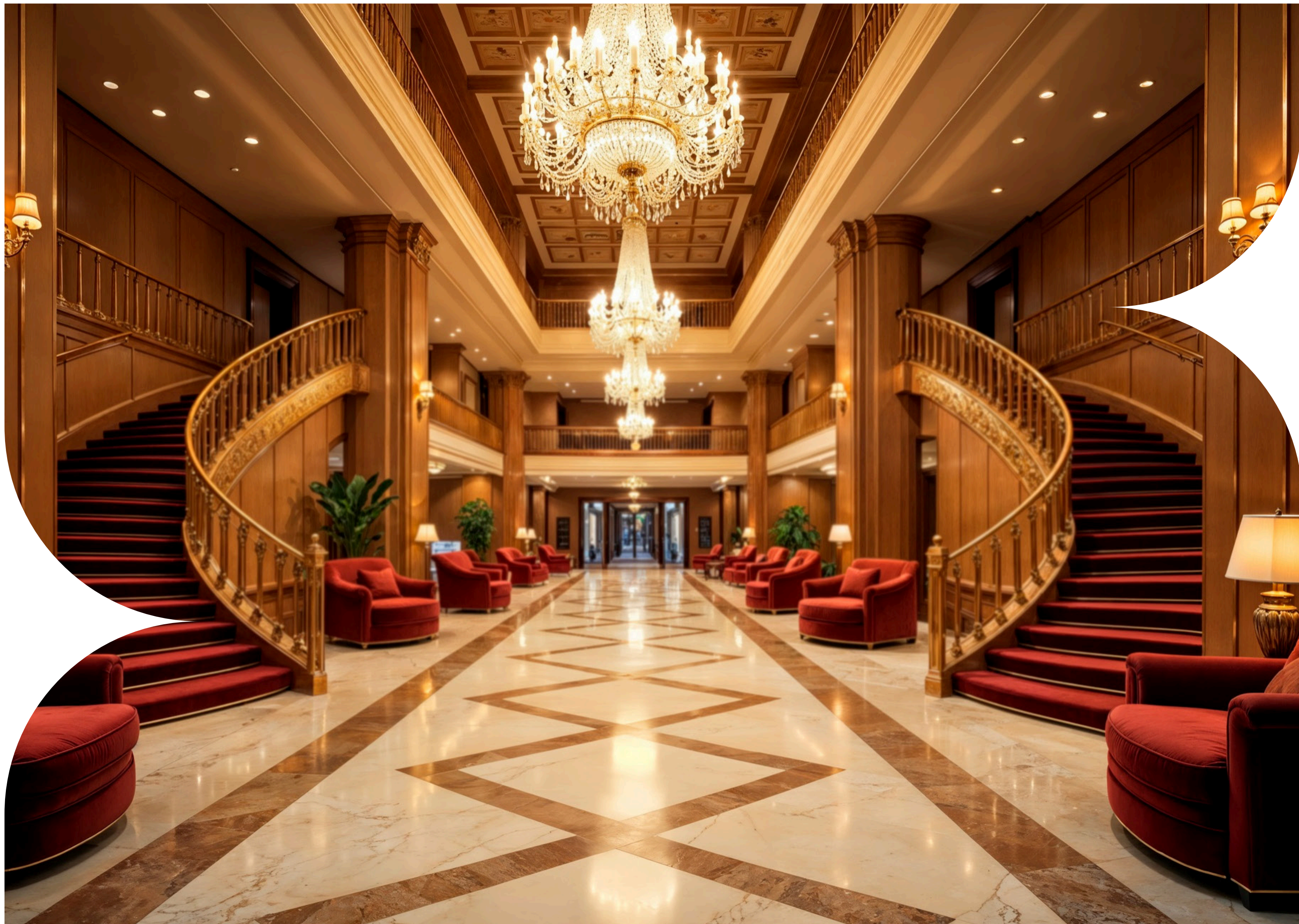
Inside The Privé Grand reception and residents' lounge