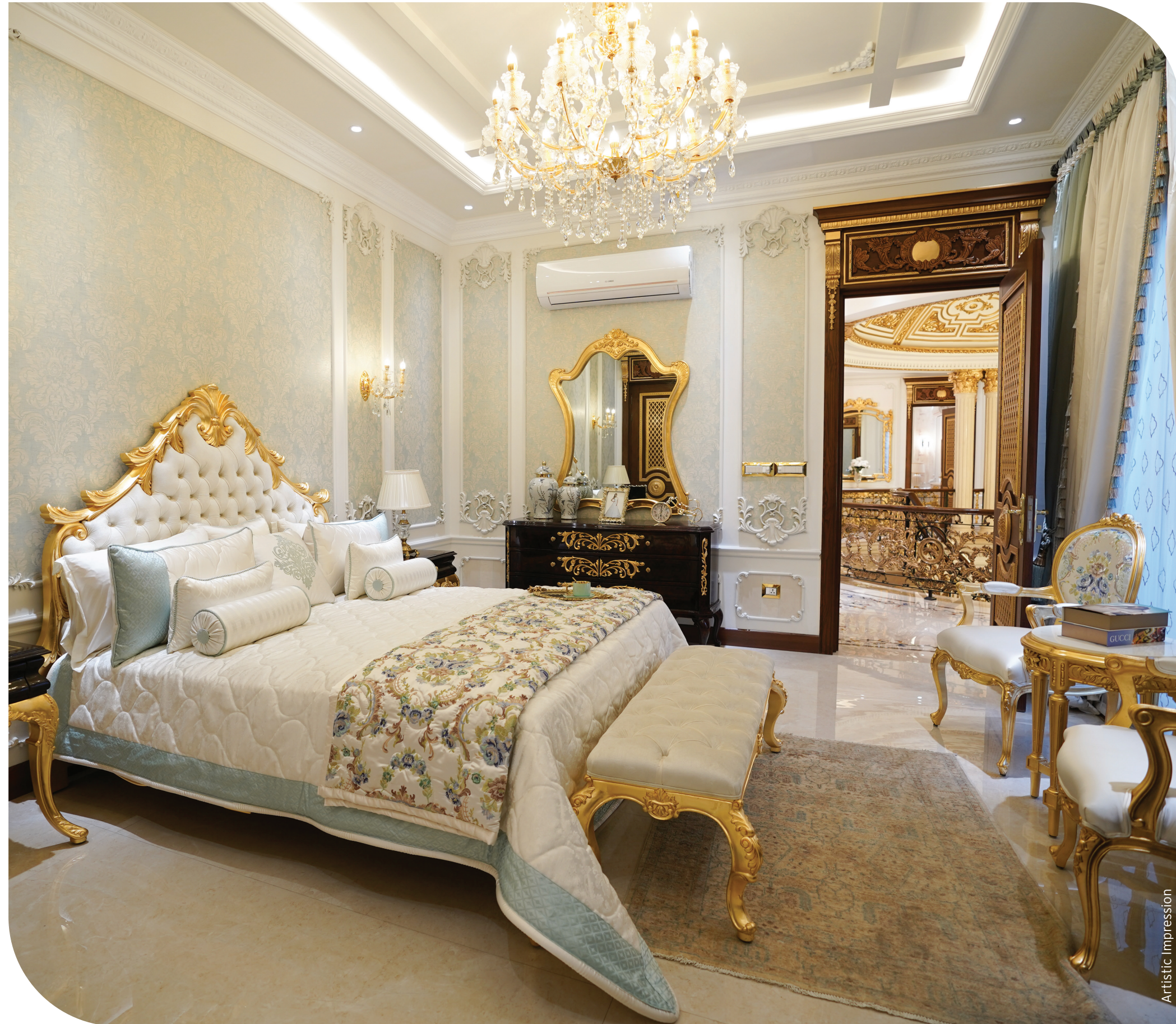
Private guest suites for family and friends