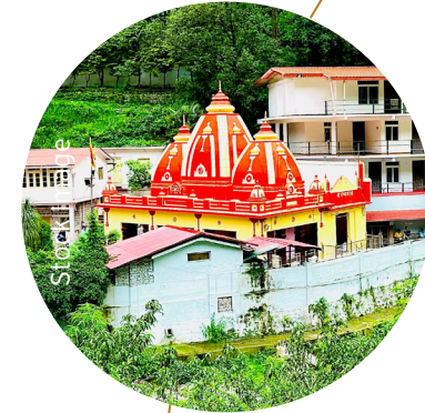
Kainchi Dham 60 Minutes

Padampuri, near Mukteshwar A rare Himalayan pocket that feels untouched yet accessible.