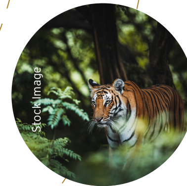
Jim Corbett National Park 180 Minutes